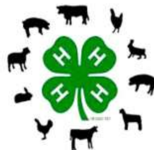
Exhibit Day is Saturday, May 18 th at Santa Maria Fairpark.